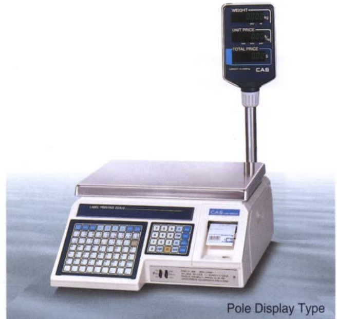
Pole Display Type

Specifications are subject to change for improvement without prior notice.